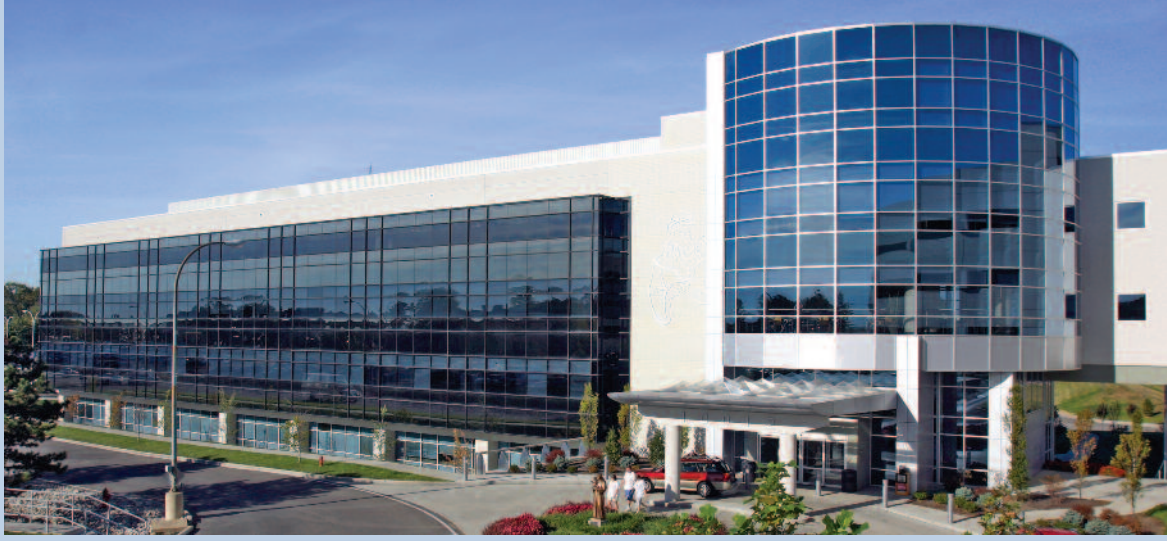
Saint Anthony Cancer Center

Two-tone colors can be achieved by specifying different finishes for exterior face members and interior mullions. The system features either stick or panel type erection with no exposed joint fasteners. The Series 4525 Curtain Wall offers the same performance as the 4500 System for applications with 1/4" (6 mm) infills.