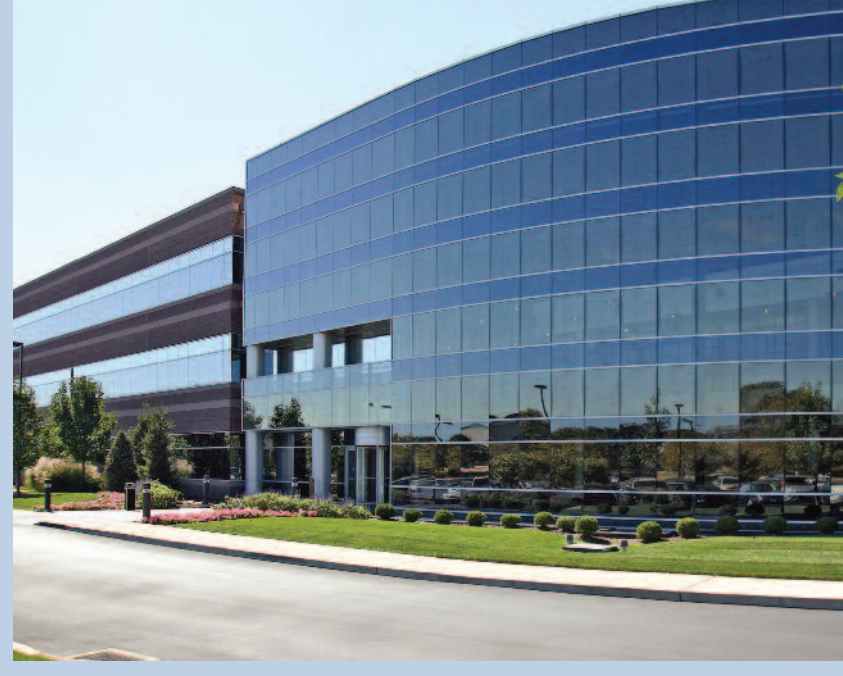
Uni-Graphic Office Building

The Series 4500 Curtain Wall features pressure relieved horizontals with a unique, integral UNIflash™ System to literally sweep infiltrated water to the exterior. UNIflash™ eliminates the secondary operation of installing rigid vinyl internal flashing in horizontals as required by similar systems. Exterior and interior members are internally joined with a non-conductive, injection molded thermoplastic connector, providing total thermal isolation which allows superior thermal performance.