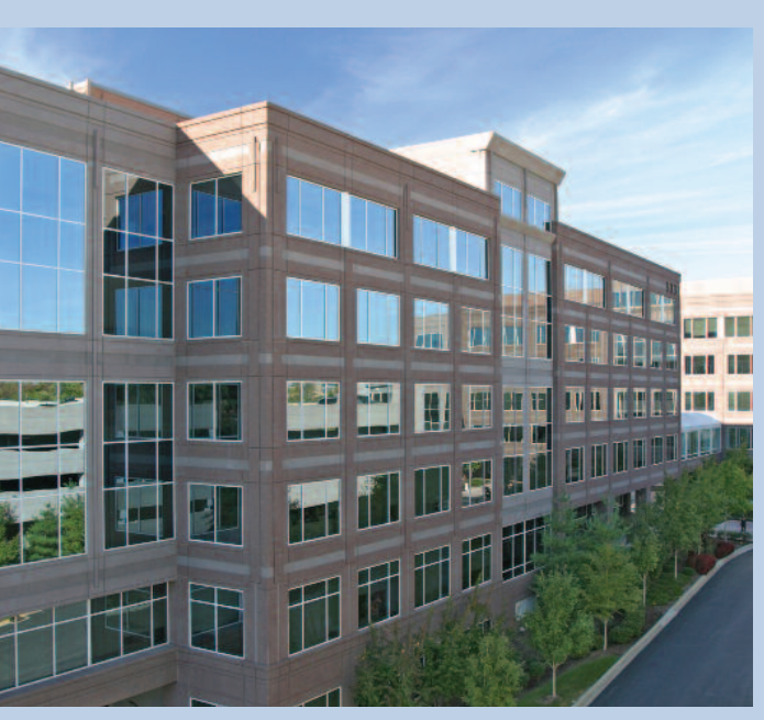
Maryville College Building 533