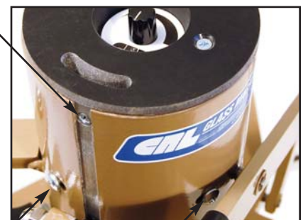
Fig. C (one of two long screws)