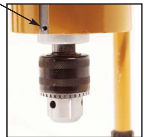
Fig. B (one of three screws)