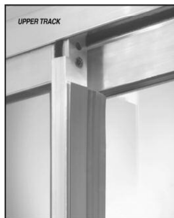
Figure 4 VINYL DRAFT SEAL