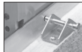
IN HEADER (OUTSIDE SLIDING DOOR)