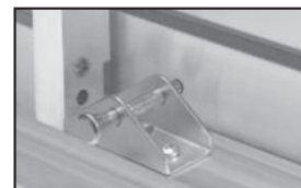
ON SILL (OUTSIDE SLIDING DOOR)