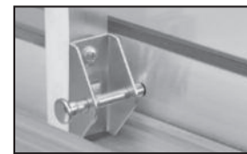
EDGE OF FIXED DOOR (OUTSIDE SLIDING DOOR)