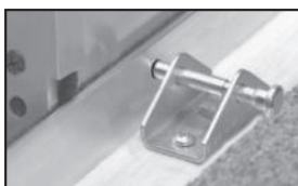
EDGE OF MOVABLE DOOR (INSIDE SLIDING DOOR)