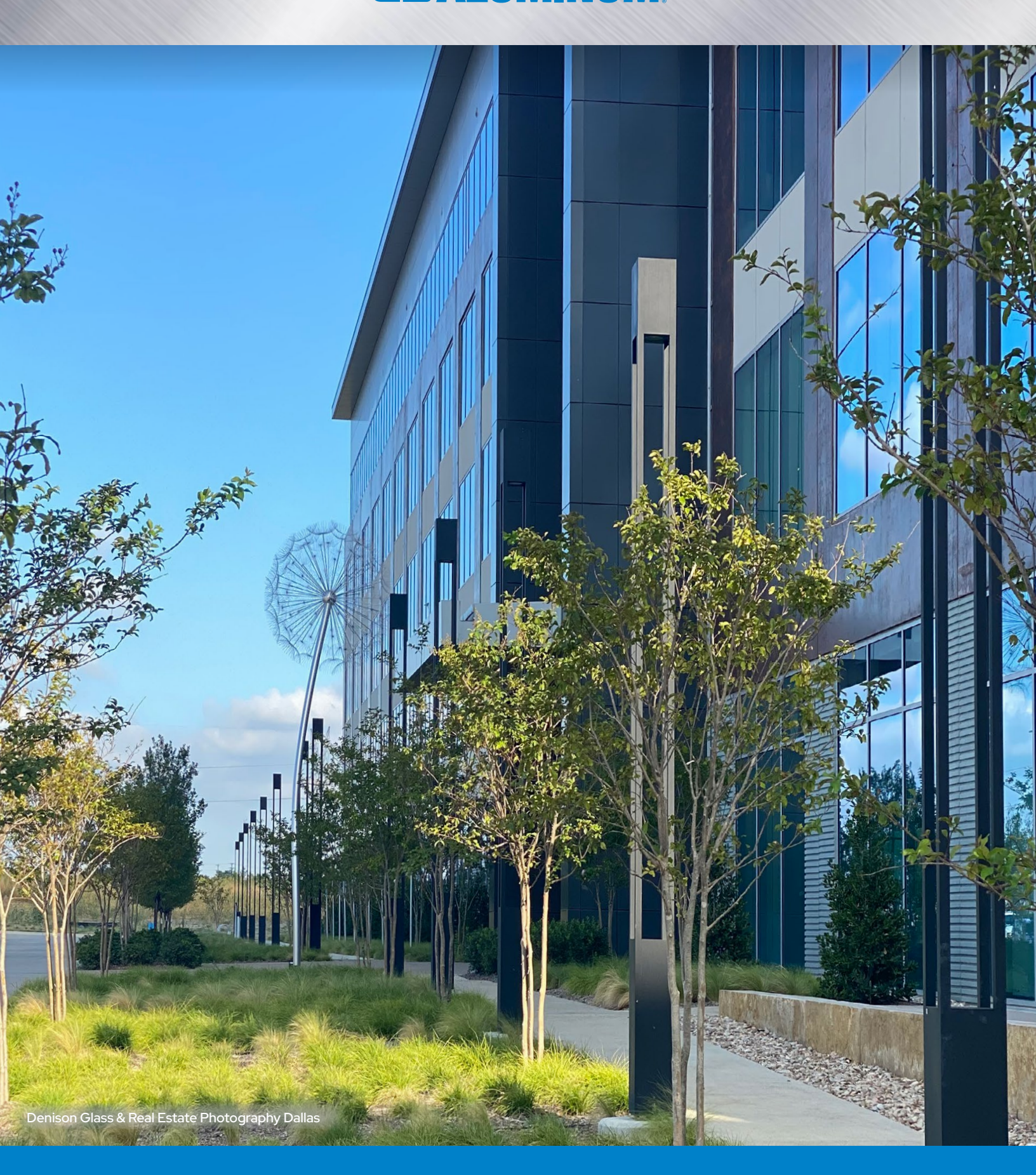
U.S. Aluminum TT501 Window Wall